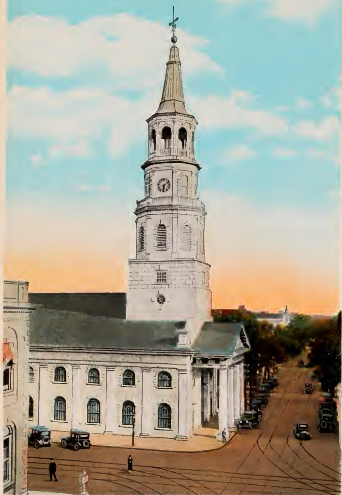
ST. MICHAEL'S CHURCH AND MEETING STREET. CHARLESTON, S. C.